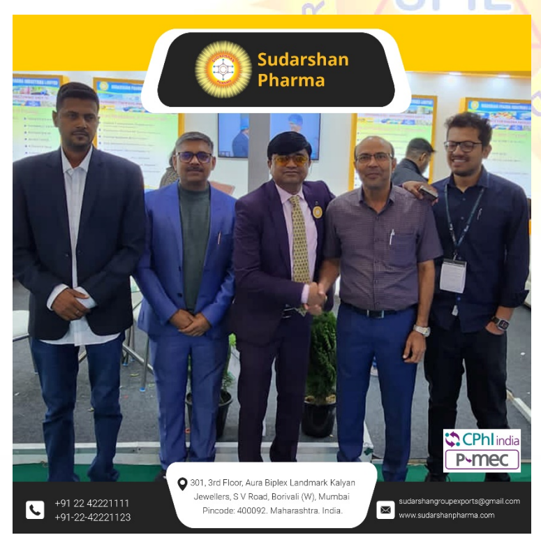
Regd. Off.: 301, Aura Biplex, Above Kalyan Jewellers, S V Road, Borivali (West), Mumbai – 400092.